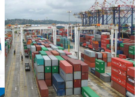
Intermodal/Combined Transport in Europe