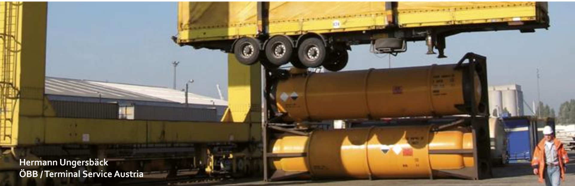
Hermann Ungersbäck ÖBB / Terminal Service Austria